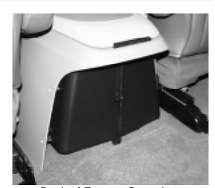
Back of Factory Console

Reinstall the rear radio controls into the video console by pushing in until it snaps into place. Install the mounting brackets onto the side of the video console. The brackets mount with the "V" shaped notch