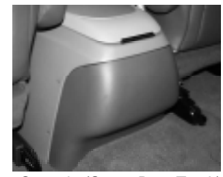
Factory Console (Super Duty Truck)